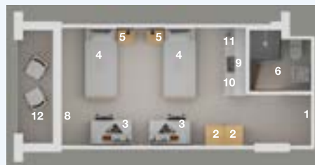
Balkonlu Oda (27 m 2 )