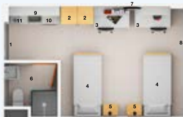
Balkonsuz Oda (22 m 2 )