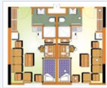
Typical single room (29 m 2 )