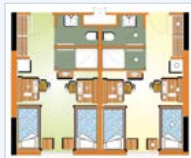
Typical double room (29 m 2 )